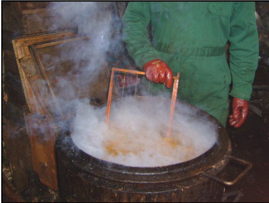
Figure 4. Immersion of wooden frames in a washing soda bath

Paraffin wax has to be heated to 160°C for 10 minutes. This is a dangerous process; a fire must be allowed to burn for up to 2 hours before it reaches the required temperature; at the same time, the flash point for paraffin wax is 199°C, so the temperature must be kept well below this level; you will need specialist equipment and heavy duty protective clothing , which the average beekeeper does not have. For further details see a suitable beekeeping textbook or research online.