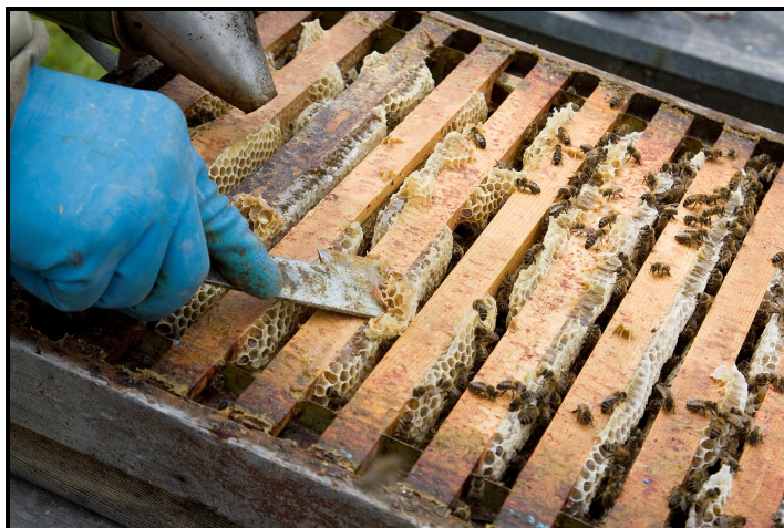
Figure 2. Removing brace comb from top bars

harbour pests and pathogens. You may wish to consider removing “dirty” frame runners altogether and replacing them with new ones when you reassemble the disinfected hive. If you plan to sterilise your equipment by scorching (see below), remember to remove all plastic runners. During the process of scraping, bits of wax and propolis will fall onto your cardboard or newspaper sheets, and all this should subsequently be destroyed by burning when you have completed this part of the cleaning process. You will also need to clean your scraper before you put it away.