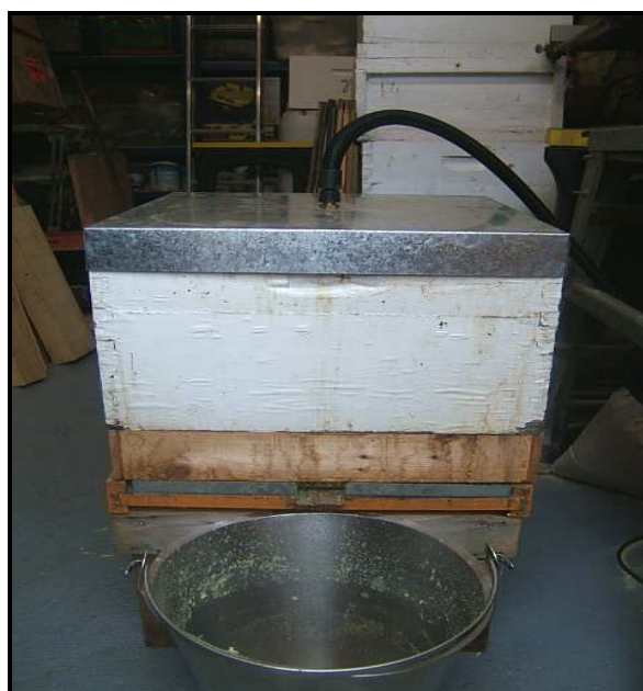
Figure 6. Steam sterilisation apparatus in situ

Begin by placing a box filled with dirty frames onto the purpose built collection tray, which needs to be similar in size and shape to a hive floor but with a small opening at one edge, and cover with the lid such that this closely fits the box; attach the end of the hose pipe from the steam chamber into the top of the sealed box (Figure 6).