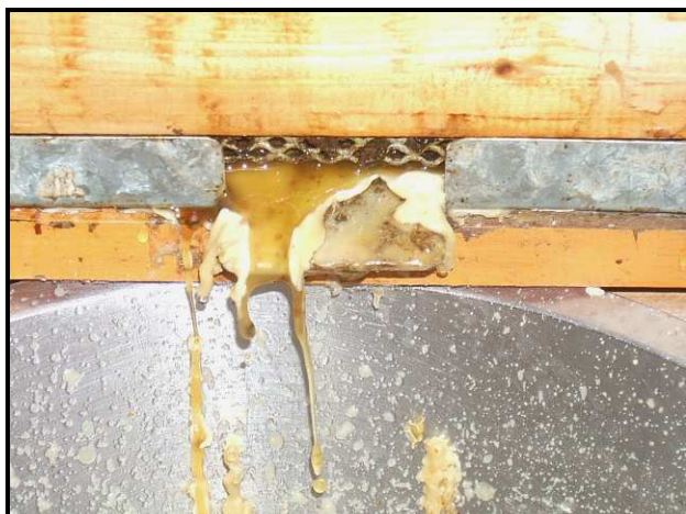
Figure 7. Molten wax collecting from steam sterilisation apparatus

stripped and cleaned wooden frames can be reused. Allow at least one hour of treatment for each box of frames.