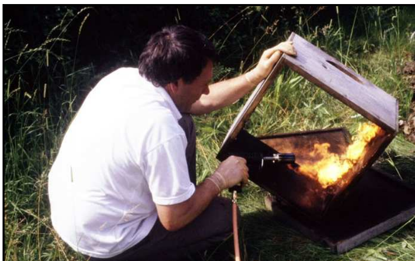
Figure 3. Scorching a brood box with a blowlamp

(Figure 3). When doing this, make sure any remaining propolis boils, and that the timber darkens to a uniform coffee-brown colour, indicating that the wood has been heated to a sufficient temperature and for enough time to be properly sterilised. There is no need to burn the timber, but do be especially thorough in the corners.