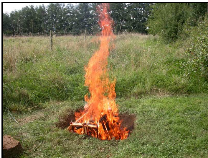
Figure 9. Burning diseased combs and frames

Both AFB and EFB are notifiable diseases. This means that if you suspect that your colonies are affected by either of these diseases you must report this to the National Bee Unit (NBU) who will provide confirmatory diagnosis. Details of how to do this are available on the NBU's BeeBase website ( www.nationalbeeunit.com ); otherwise, a contact telephone number is also provided at the end of this article. Even before diagnosis is confirmed, close the hive and reduce the size of the entrance, and take any other steps necessary to prevent the hive being robbed by other colonies in the area. Disinfect gloves and other beekeeping equipment with a strong solution of washing soda before examining other colonies. If AFB is subsequently confirmed, your local Bee Inspector will burn infected colonies, and hives must be sterilised before reuse. NB. Virkon S is very effective against non-spore forming microbes such as EFB bacteria and viruses. It is not , however, recommended for AFB – use a hypochlorite based cleaner i.e. bleach. If EFB is confirmed, lightly infected colonies may be treated, but as with AFB, colonies with severe EFB infections will be destroyed.