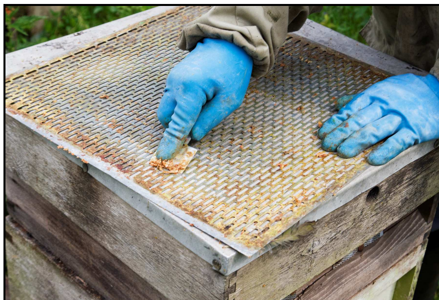
Figure 8. Removing debris from an excluder

under these conditions. A wire brush is very useful to remove bits of wax and propolis. Wire excluders can then be scorched using a blowlamp, but if they are soldered be careful not to melt the solder joints as sometimes they are very 'soft'. If foul brood has been present, zinc slotted excluders must be destroyed by burning. Otherwise, it is possible to scrub these clean with a solution of washing soda. This needs to be fairly concentrated (1 kilogram soda to 5 litres of water), and a dash of washing up liquid in the mix also helps. You will need to wear suitable protective clothing, protect your eyes and use rubber gloves. Plastic excluders can be disinfected in the same way as plastic hives and components, as described above.